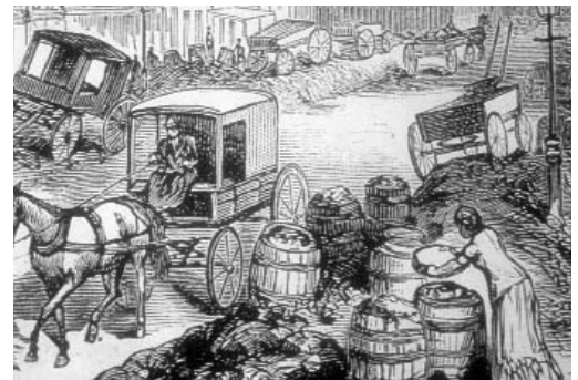
In the late 1860s, garbage was placed in leaking barrels on the street edge and picked through by salvagers and otherwise left for animals.

In 1935, the precursor to the modern landfill was started in California where waste was thrown into a hole in the ground that was periodically covered with dirt. The American Society of Civil Engineers in 1959 published the first guidelines for a "sanitary landfill" that suggested compacting waste and covering it with a layer of soil each day to reduce odors and control rodents.