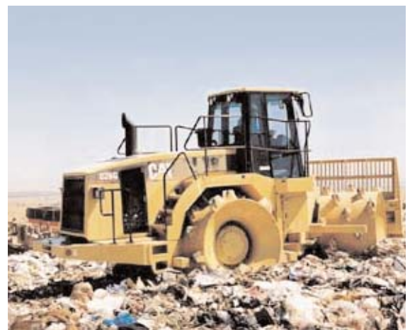
Compactors are used on the working face of landfills to move garbage and reduce the waste's volume.

In short, the sophisticated engineered systems in a modern landfill ensure protection of human health and the environment by containing leachate that can contaminate groundwater, preventing the infiltration of precipitation that generates leachate after closure of the landfill, and collecting landfill gas which can be used as an energy source or destroyed.