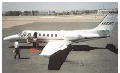
Palomar Airport is partially built on a Category 1 closed landfill.