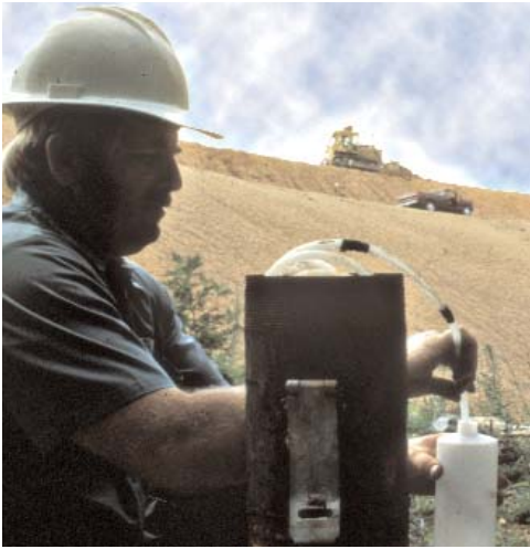
Testing of water samples in groundwater monitoring wells at modern landfills ensures that leachate collection systems are working correctly to protect public health and the environment.

most cases, contaminant concentrations in leachate from modern landfills are one to two orders of magnitude less compared to older landfills. Moreover, EPA research anticipates that the quality of leachate will continue to show improvement over time as the existing public database for modern landfills increases.